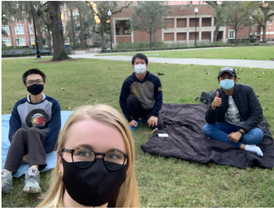
Students at the Plaza Hangout on February 9, 2021