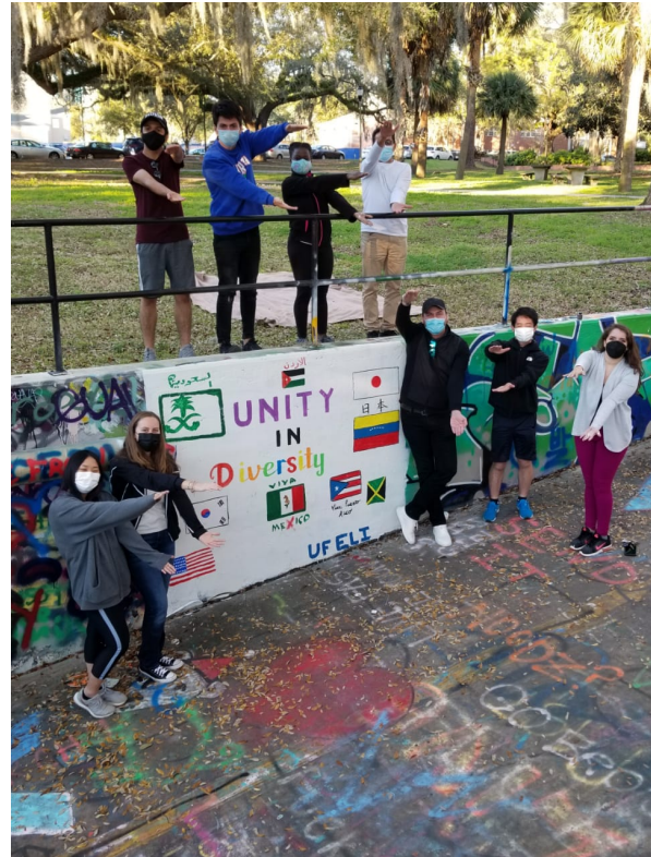
ELI students, LAs and Staff at the Paint the Wall Event February 20, 2021

https://www.signupgenius.com/go/20F0C4BA9A823A02-plaza15