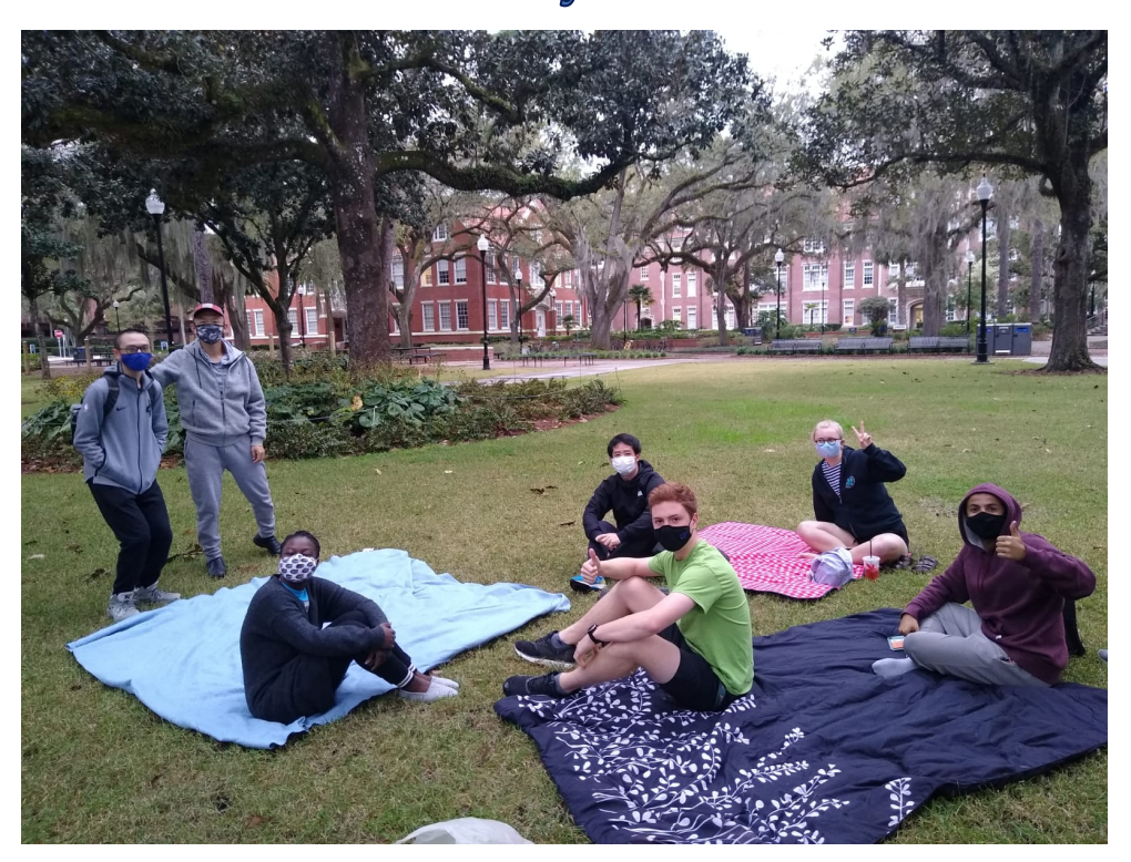
ELI students and LAs at the Plaza Hangout, March 2, 2021