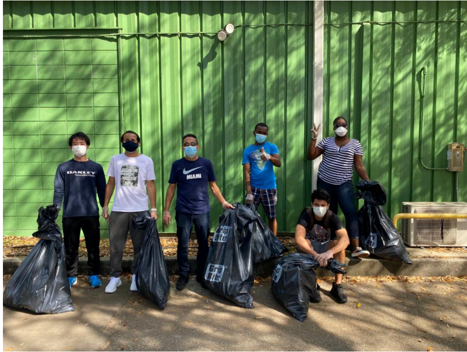
Volunteer Day, Saint Francis House, March 13, 2021