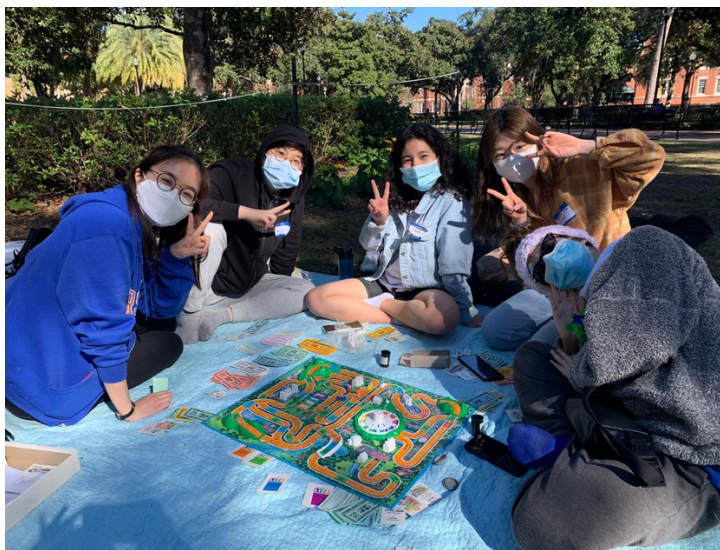
ELI students play the game of Life at the Welcome Activity.