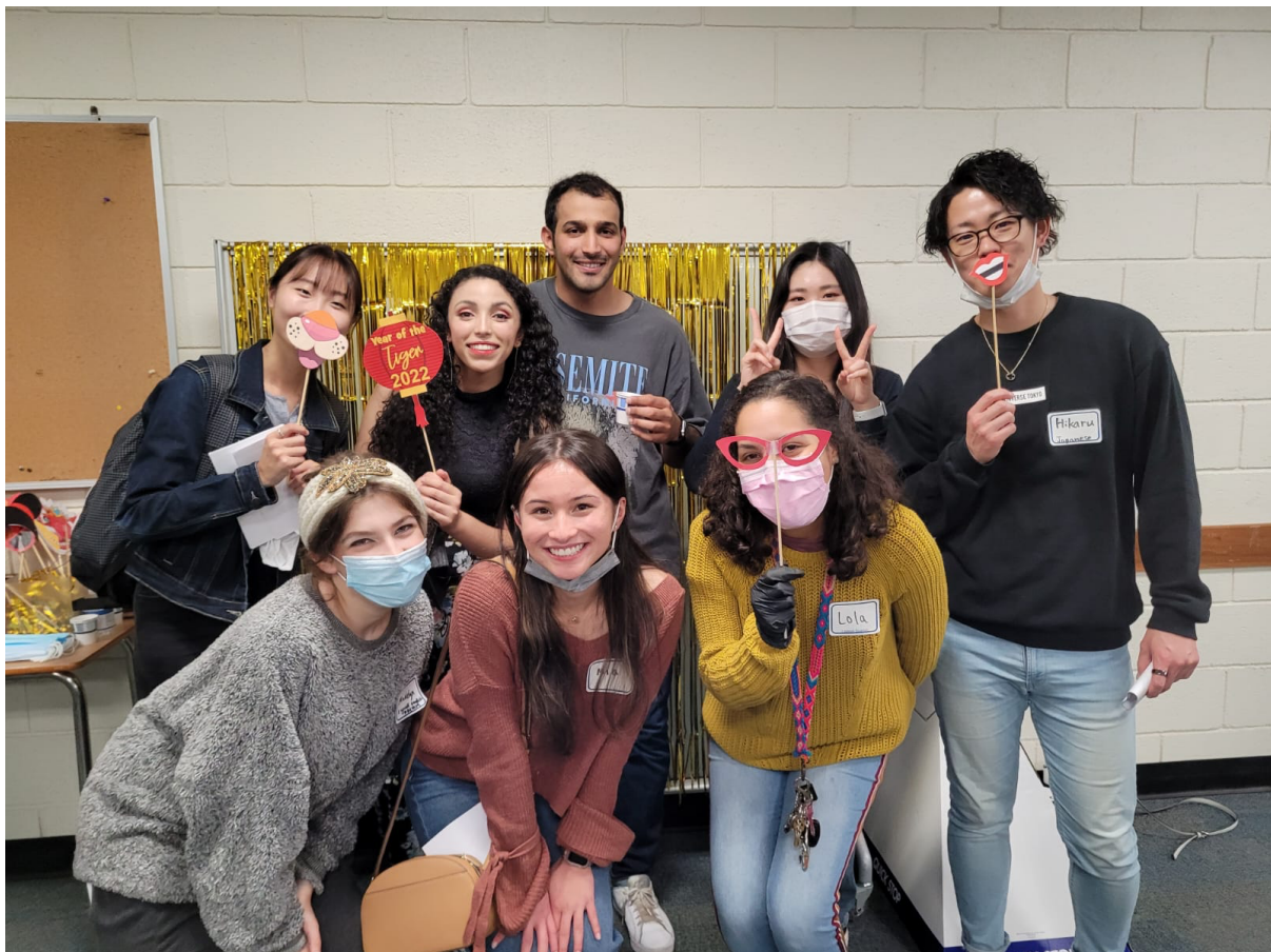
Photo Booth at the International Mixer