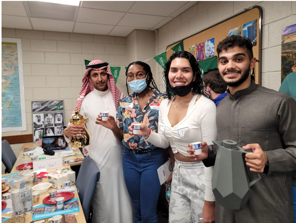
Tasting coffee at the International Mixer

The International Mixer was a nice activity to meet friends from around the world! This was an activity for ELI students and UF students who are interested in various cultures and languages. Many people attended this activity to show and learn about various cultures. The tables were separated into many parts like tables for Korean, Chinese, Spanish, and Arabic. We were able to learn the culture and language by going to the table you want. I learned Chinese language and culture, too.