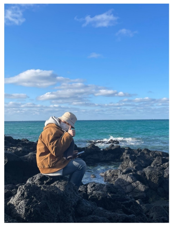
Jeju Island

If you like nature and you have a plan to visit Korea, there is a place that you should visit at least once. It is Jeju Island. It is located in the southern part of South Korea, so it's the warmest location that you could find in Korea. It is famous for its nature and food, which, I think, are the most important parts in traveling. It's an island, so you can commonly see the beaches and it's made of a volcano's lava. So, you can commonly see special rocks that have lots of holes and are dark black. Since it has a volcano that is inactive, you can go on a hike. When you hike you can see the green in Hanra Mountain. Moving on to the food, there is a special pig called 'heukdoweji' which means black pig. Its skin color is black, and its texture is chewy and soft. There are a lot of fish which is caught right before it's served because it's an island. Jeju Island is also as known for its oranges that have lots of sweet juice. You can have so many diverse foods whenever you want.