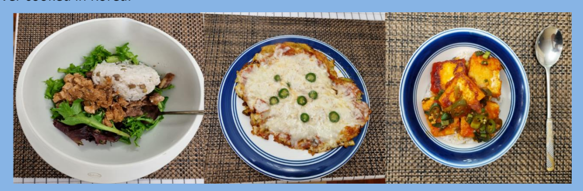
Fig. 1. Several dishes I made. From left side, Bibimbap with soybean paste, cabbage pizza, and Boiled tofu with red pepper paste.

The ELI life has been not also exciting but also challenging. I found two wonderful places to study during breaktime, which are the Reitz union building and the Learning Commons that is in the opposite building of the Hub. So far, however, it is a little difficult to balance between doing homework and preparing tests, and participating the CIP activities such as valley ball games, Gator nights, and the Talent show. Cooking is also challenging for me because I have never cooked in Korea.