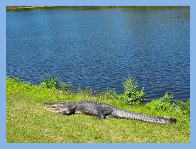
Fig. 3. An alligator enjoying the sunshine in edge of lake.

Finally, I saw alligators last Saturday. On March 26, I and my friend visited the Sweetwater Wetlands Park where many gators were enjoying the sunshine in an edge of lake. Also, we watched a snake eating a big frog in a swamp. Because the sunlight was very strong, I had sunburn in both arms only in a few hours.