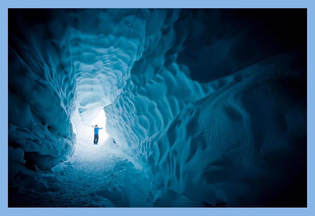
Ice walk in The Park Paine Towers

Finally, the hospitality of the locals is distinctive. They are special for their kindness, joy and passivity, which really impresses the guests. In the south we can find different types of people, such as, the muleteers are an important part of the landscape, dedicated to land transport, which due to the complexity of the area are essential in moving animals from one place to another. The fishermen, who offer their products by the sea, and even some have already settled with comfortable premises to serve tourists. The majesty of the place is clearly reflected in the peaceful and friendly character of the locals. It seems that the word "stress" does not exist in the area. As a part of the lyrics of the national anthem says, honoring the beauty of the place, the south of Chile, "is the happy copy of Eden": a complete harmony.