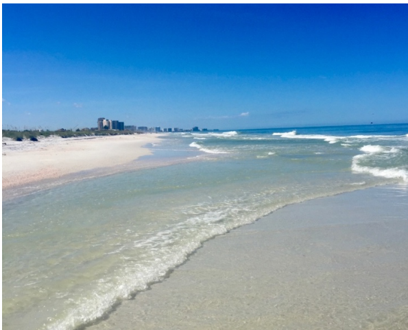
Clearwater Beach: Photo Credit https://en.wikipedia.org/wiki/Clearwater_Beach

Tate is selling bus tickets starting Monday, September 12, for the Clearwater Beach bus trip on Saturday September 24 th ! This is a full day trip. Buy your ticket from the CIP office (MAT 211) between 9 and 12:30pm with 25 dollars exact cash and your Gator IID card. Spaces are limited and are sold on a first come first serve basis.