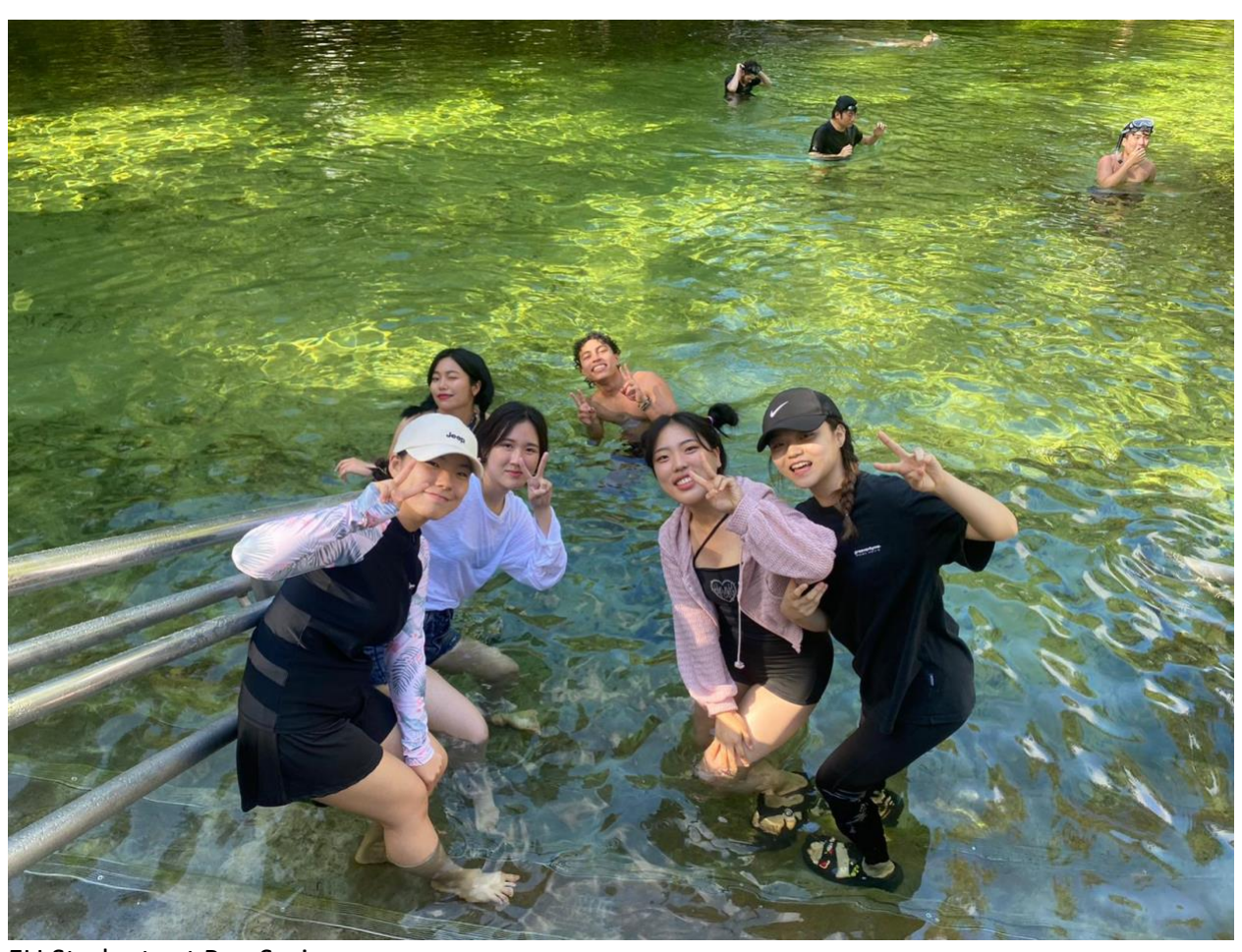
ELI Students at Poe Springs