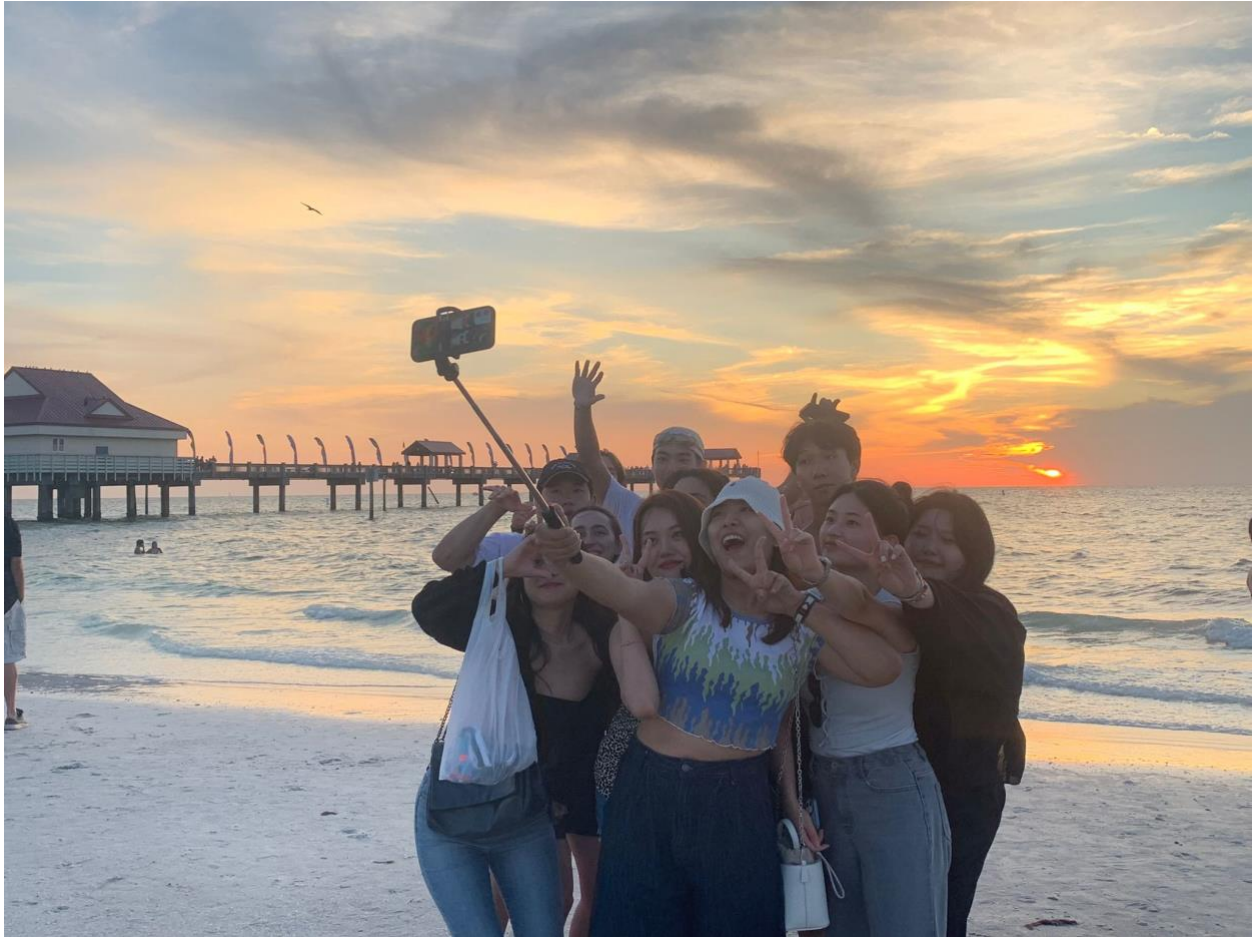
ELI students take a photo at sunset at Clearwater Beach.