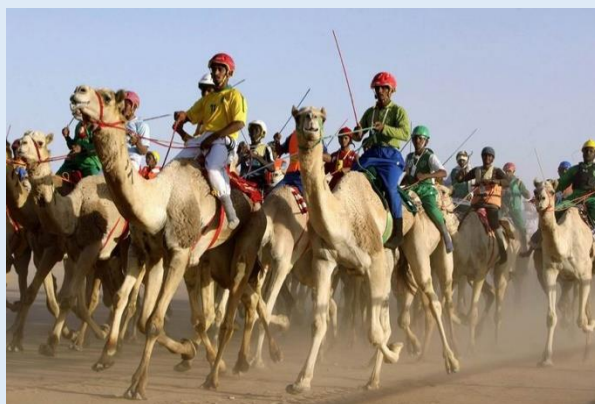
Camel Races at the Jenadriyah Festival