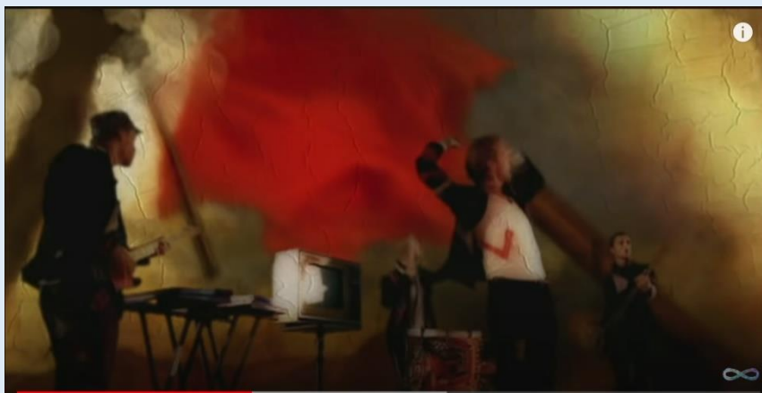
Shattered-screen visual effect. (The official music video of Viva la Vida by Coldplay, 2008, YouTube video,

How is the king's lost power expressed? At every scene of the video, shattered screen visual effect is shown. By using the shattered-screen visual effect, Coldplay intended to show the king's power is just heritage which is glorious but doesn't have power anymore. The shattered visual effect in the video is similar with the shatters of heritage, especially some ancient potteries. As we can see at the downside, the shattered effect in the video is similar with the shatters of an ancient pottery. Because of the similar point, the screen effects let us imagine the story of the video like the shattered pottery, which shows glorious past but doesn't useful anymore.