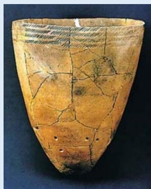
A shattered-ancient pottery. (Shaka's professional barbequer,

https://www.youtube.com/watch?v=dvgZkm1xWPE )