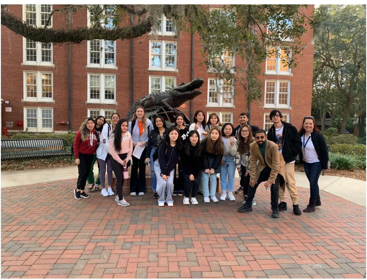
ELI students at the Gator Ubiquity sculpture

Gator Ubiquity is the name of the sculpture between Matherly and Bryan Halls. It depicts an alligator on top of the Earth. The sculpture is eight feet tall and 6 feet wide. It is made of bronze and weighs about 1,500 lbs. It symbolizes the impact and relationships of UF Gators all over the world, and now you are part of this group! Gator Ubiquity is not the only gator art on campus. As you explore campus, see if you can find gator statues, sculptures, and other gator artwork. There are also real gators on campus that are visible close to or in the ponds on campus. The little pond just outside the Reitz Union is one place you can see alligators.