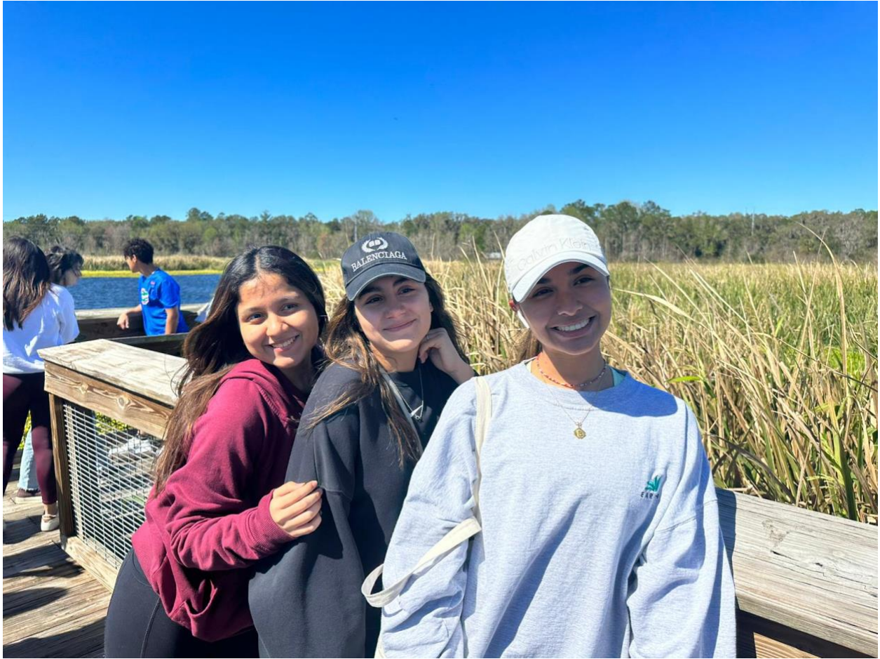
Sweetwater Park Nature Walk