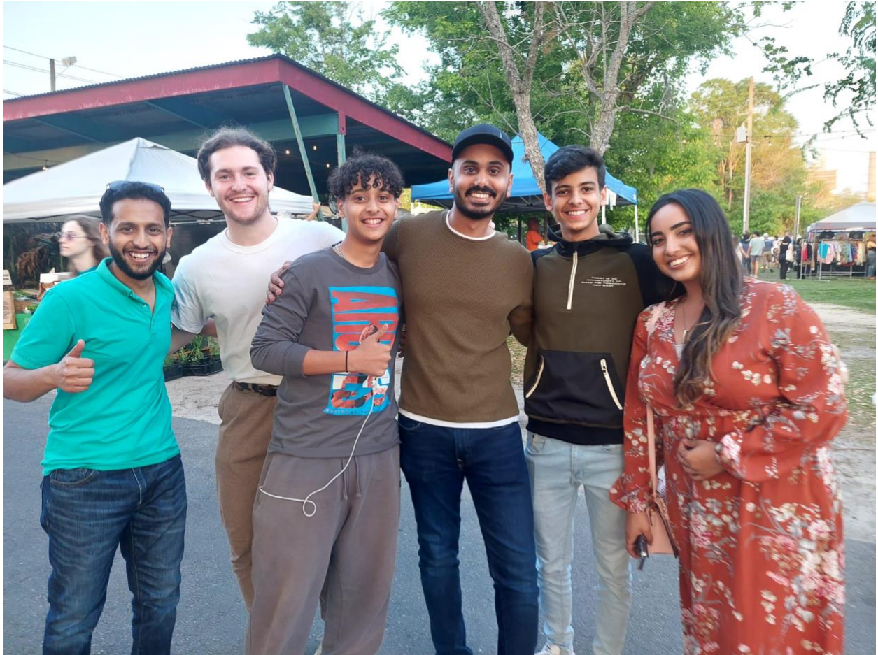
At the Gainesville farmers market