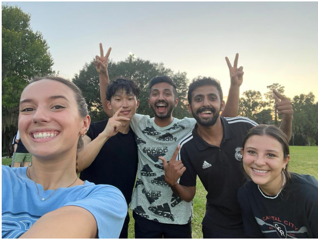
ELI students at the soccer activity!