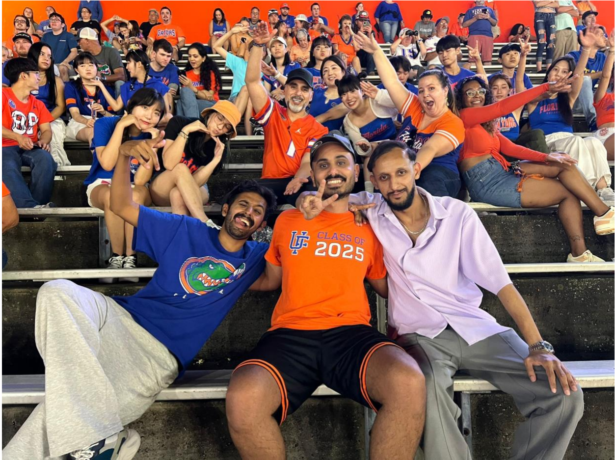
At the UF football game