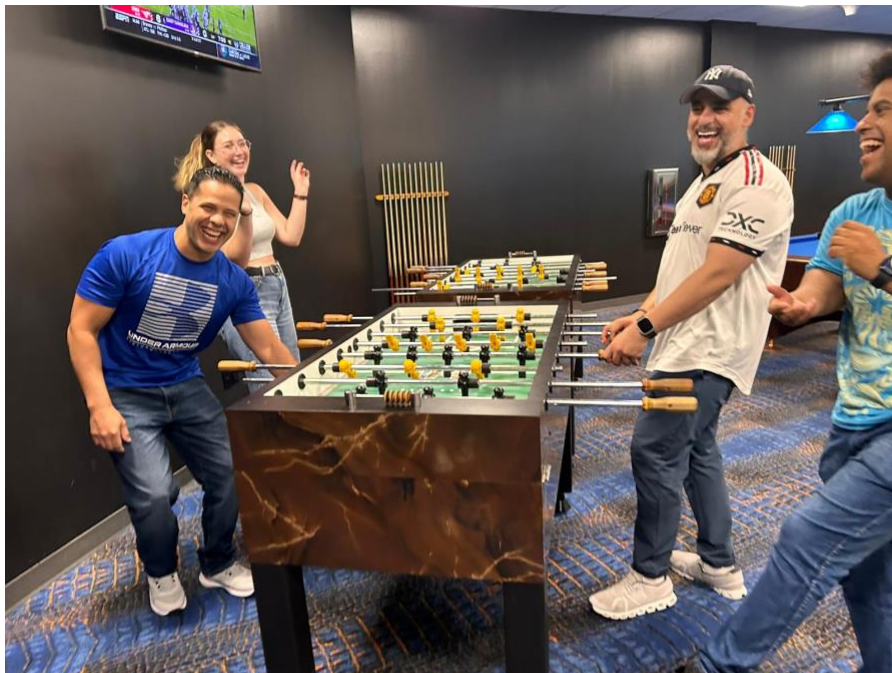
Reitz Game Room