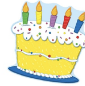
Photo of the Week