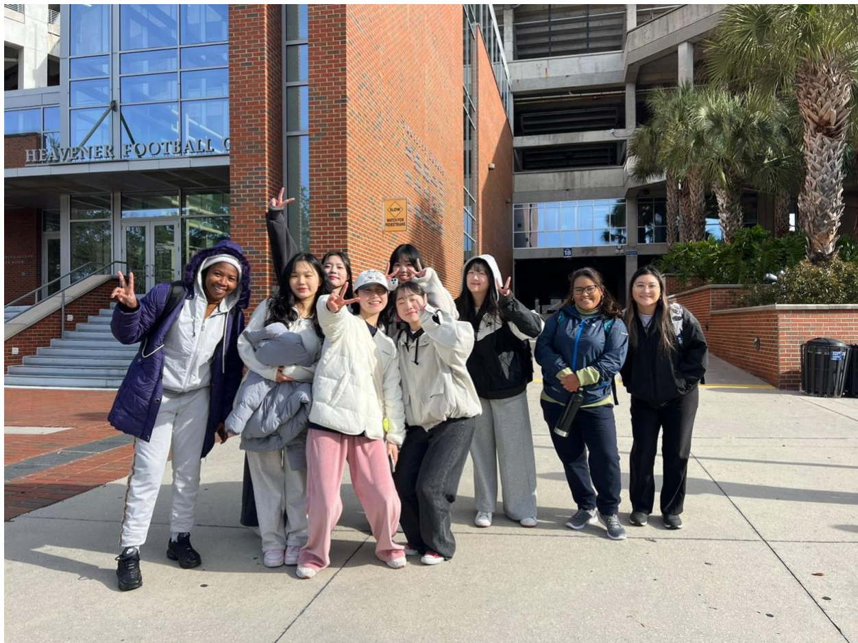
ELI students on a tour of campus.