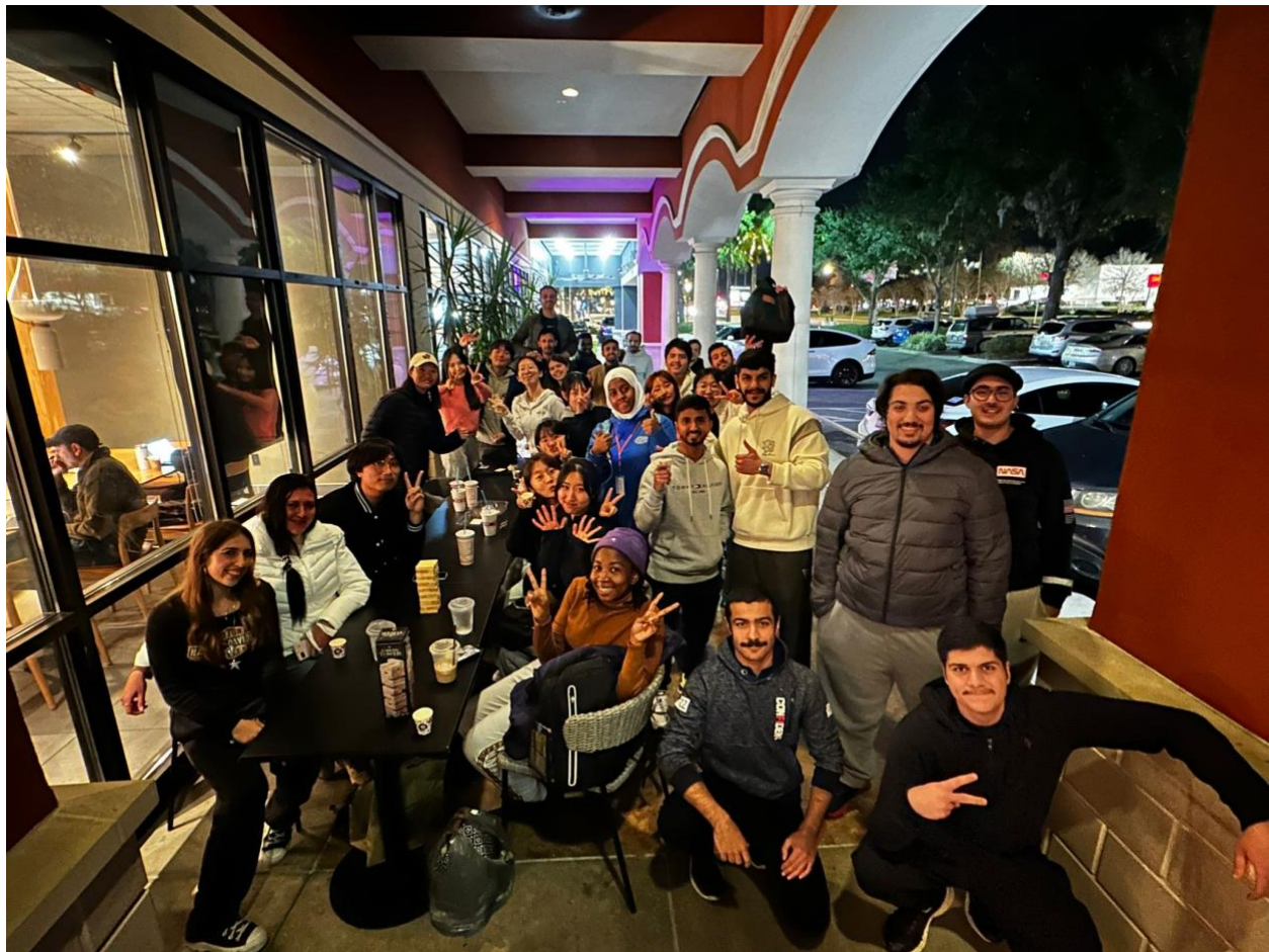
ELI students at coffee talk!