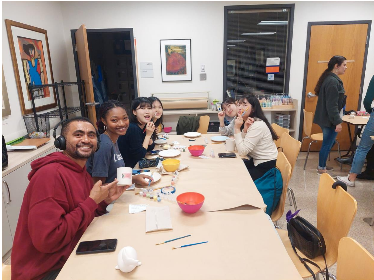
Arts and crafts at the Reitz!