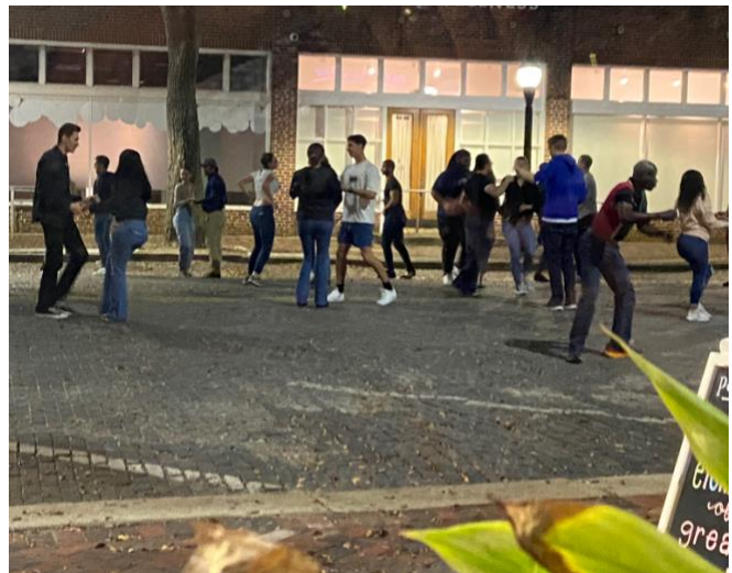
Downtown dancing in the streets!

Since many of our students are from Latin America, many know how to dance cumbia, salsa, bachata, and merengue. Which country has the best dancers? For salsa, I've always heard it was the Colombians! Especially the Colombians from the city of Cali. Is that true? Gainesville does not have the night clubs like Miami does, but there are many opportunities to dance! If you want to socialize with UF students, the University of Florida has a salsa club called Gator Salsa. When they meet, they dance outdoors at Ben Hill Griffin Stadium and the Bull (Downtown). They have Casino Salsa, On-1 Salsa, Bachata, and social dancing on Tuesdays and Thursdays. Sometimes the ELI goes for a weeknight activity!