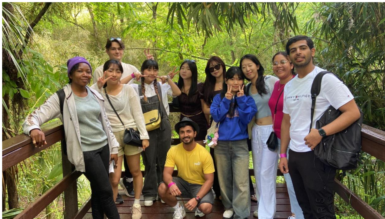
Students visiting Kanapaha Botanical Gardens