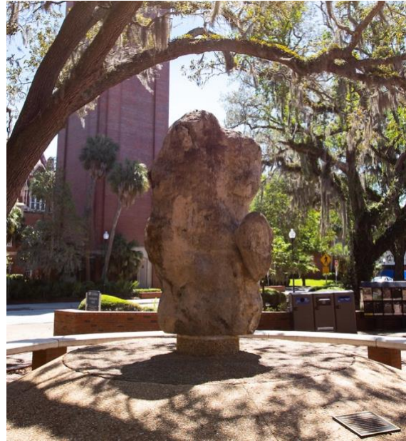
The Potato

One quirky University of Florida landmark is a giant rock outside of Turlington Hall. The rock is 30,000 years old, and its shape and color resemble America's favorite vegetable—the potato! In fact, UF students fondly call this rock the “Potato” and it is used as a landmark for meeting friends. If you find this rock on campus, go up to it and look closely. You will see fossils of shells.