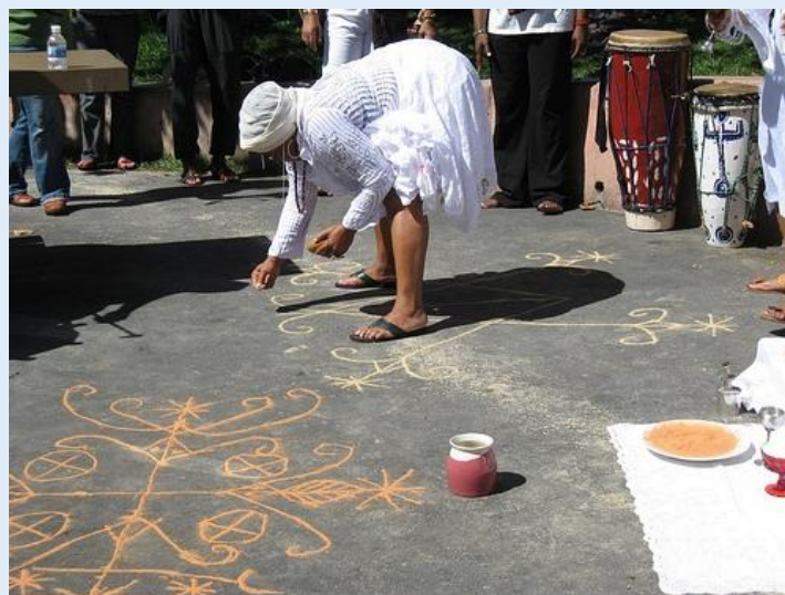
Vèvè were drawn by a priestess (Mambo)

Vèvè is not just an artistic pattern; it is a sacred symbol of Haitian spirituality. Each single drawn symbol is an invocation, a bridge between the human world and the spirits world, linking generations through ritual and faith. This heritage should be preserved and appreciated because it is a sign of hope and peace for this nation.