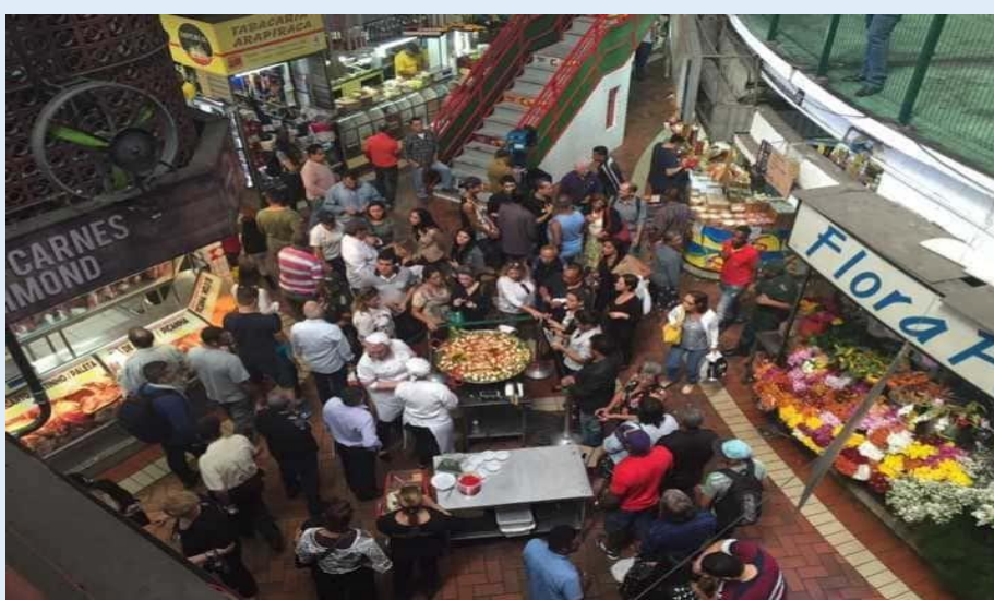
Mercado Central - top view.

In other words, come to visit us and you will have a radical and unique experience!