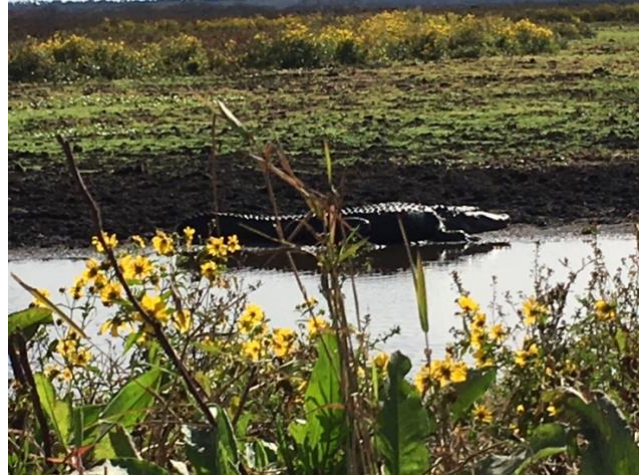
On the La Chua Trail in Paynes Prairie

Have you ever seen alligators? If you want to see them, you should come to Gainesville! This amazing city is located in North Central Florida. There are many springs and lakes around. It is common to find many alligators in the University of Florida campus. Also, they live in a natural harmony if they are not provoked by humans. There are a few ways you have to know in order to live close to alligators: maintaining a safe distance and avoiding feeding alligators for fun.